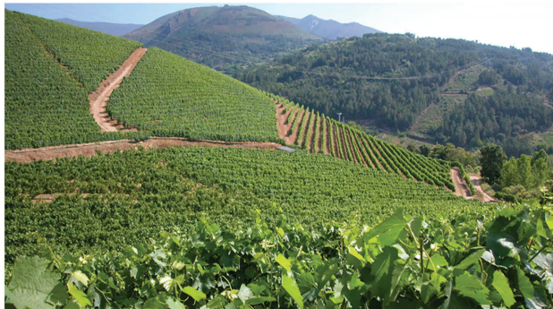
Bodegas Godeval has produced Godello wines in the Valdeorras region for over 30 years.

New reviews of Tempranillo, Garnacha and Albariño from Ribera del Duero, Rias Baixas and more